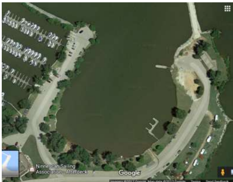
Aerial view of Sailboat Cove.